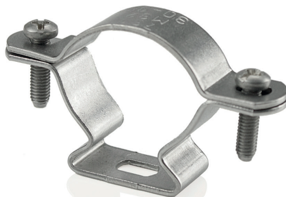
disegno dimensionale / reference details